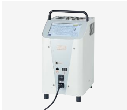
LTR-150 Dry Block/ Liquid Bath