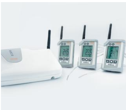
RF ValProbe® II